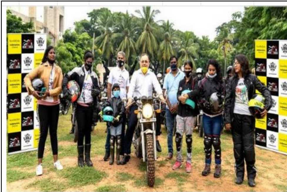
Ride in India - 'Motorcycle Tourism' campaign launched on World Tourism Day

Link : https://www.aninews.in/news/business/ride-in-india-motorcycle-tourism-campaign-launched-on-world-tourism-day20200928182337/