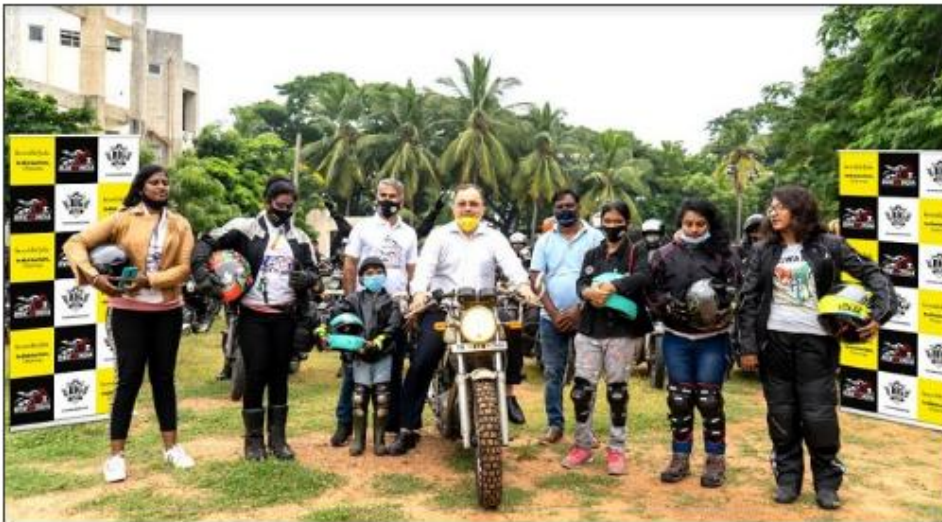
On the eve of World Tourism Day, Big Biking Commune one of the largest aggregator platform for the motorcycle community in partnership with India Tourism Chennai, flagged off the Ride in India Campaign. From (L to R ) Mr.

On the occasion of the World Tourism Day (27th September) India tourism, Chennai and the Big Biking Commune organised the flag-off of the 'Ride in India' campaign, an initiative to promote Motorcycles as a safe and responsible way to promote and boost domestic tourism. The flag-off event was held during the morning hours at the Institute of Hotel Management, Catering Technology and Applied Nutrition, Taramani, Chennai.